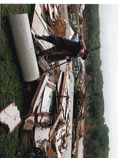
Debris removal after the 2015 Memorial Day Flooding

The BR3T has raised over $100,000 in 2018 that have been directly applied to closing out our final cases from the Memorial Day floods. BR3T is still taking on cases. If you know of any flood survivors that are still in need of assistance, please contact our offices.