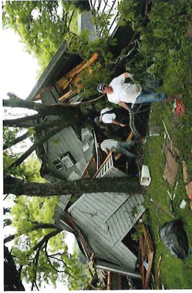
Memorial Day Flooding 2015

It's important to us to be clear about what we do. These are our support teams that help in every area of recovery.